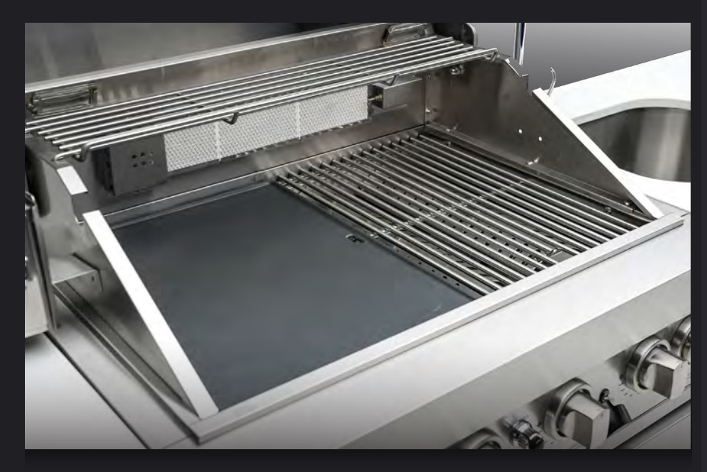
REPLACES 1/2 OF THE 4 BURNER COOKING AREA 957 and 400 series.