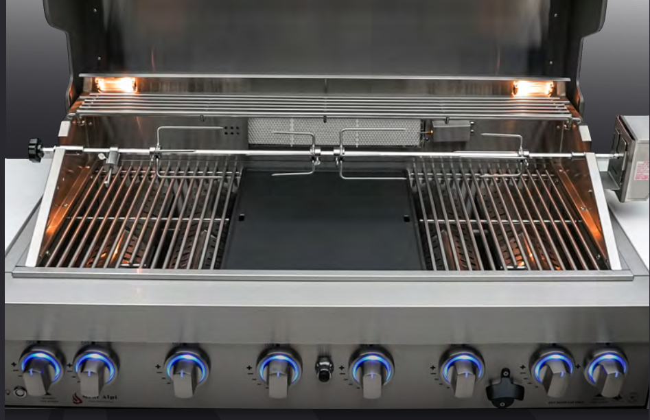
REPLACES <sup>1</sup>/<sub>3</sub> OF THE 6 BURNER COOKING AREA 805 series.